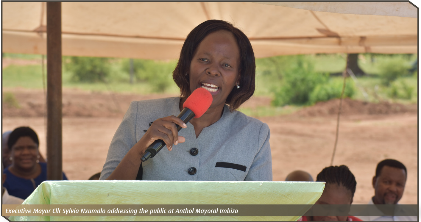
Executive Mayor Cllr Sylvia Nxumalo addressing the public at Anthol Mayoral Imbizo

The municipality hosted a Mayoral Imbizo at Christ for Africa Church in Anthol in the Hluvukani region near Manyeleti Game Reserve, on 31 January 2019.