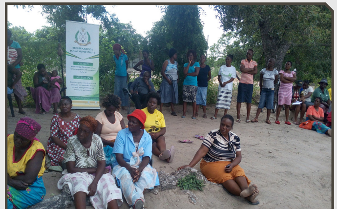
Islington community listening to the Mayor's address

Handing over the contractor, she urged members of the community to safeguard the borehole since it wasn't only the municipality that was involved in the project but ESKOM will ensure the supply