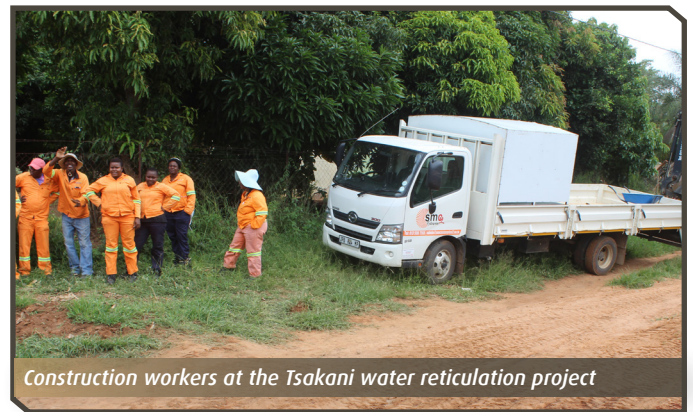
Construction workers at the Tsakani water reticulation project

The project does not only bring relief to the struggle of water but residents will now have enough time to run other households and family errands. The Mayor is delighted that we are making inroads with regards to the provision of clean water to our communities.