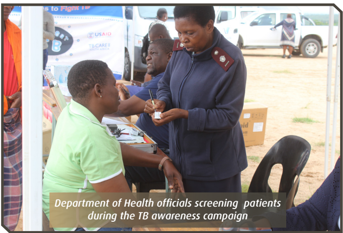
Department of Health officials screening patients during the TB awareness campaign