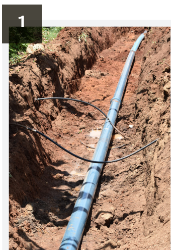
Laying of pipes at Goromane (Madras B) in progress

Community members have had a difficult time driving through the gravel road during rainy seasons, but this will soon be a thing of a past once the road is completed. The Mayor is urging community members to exercise patience while the road is being upgraded.