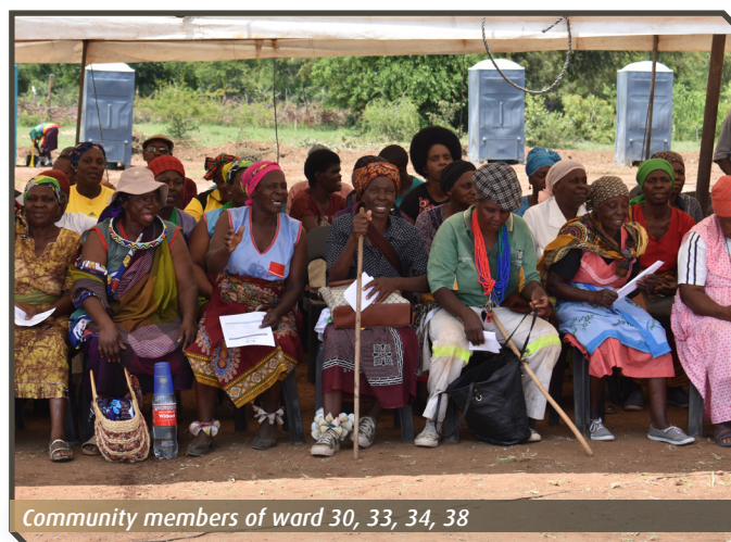
Community members of ward 30, 33, 34, 38

The Executive Mayor urged everyone to guard government infrastructures because most of the community members vandalise and steal transformers which then leads to a crisis of water in some villages. After the completion of Injaka bulk water supply all villages will have enough water, the Mayor urged people not to misuse water and avoid unnecessarily watering their gardens but use water saving ways to do so, as water is a scarce resource in our area.