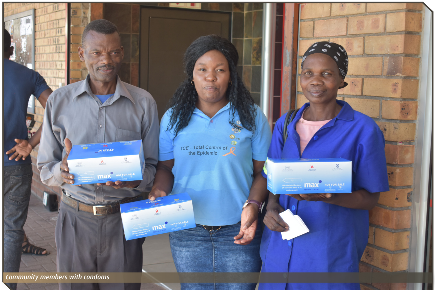
Community members with condoms

In raising awareness of Sexual Transmitted Infections (STI's) and the use of condoms, Bushbuckridge Local Municipality (BLM) with the support of the Department of Health (DoH) hosted a three-day (19 - 21 February 2019) STI Condom week campaign at Mkhuhlu Plaza, Thulamahashe Mall and Hlukukani Taxi Rank under the theme: Know your STI Signs and Symptoms and use condom correctly and consistently.