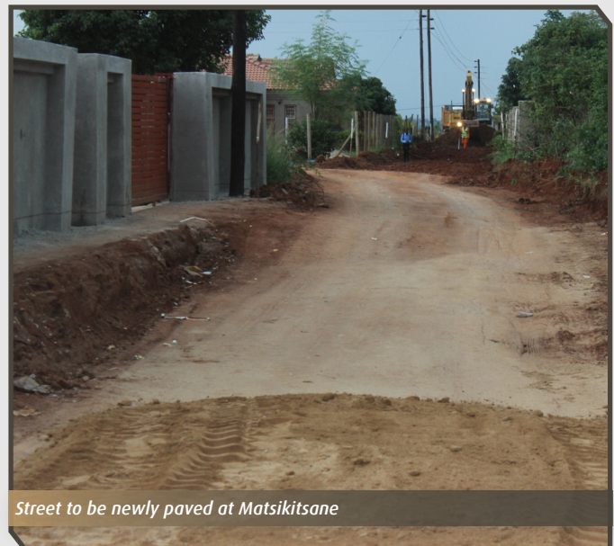
Street to be newly paved at Matsikitsane

The project has created 21 jobs for the local community, it is sitting at 48% completion and is set to benefit 141 households. The municipality is working on changing the face of Matsikitsane into a notable township, this is done in phases and the area now has been electrified and has clean running water.