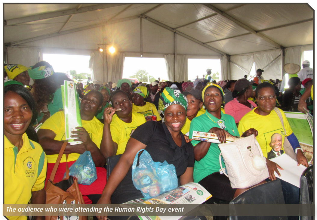
The audience who were attending the Human Rights Day event

The event was graced by representatives from Independent Electoral Commission (IEC), Human Rights Commission, Ehlanzeni District Municipality and House of Traditional Leaders in Mpumalanga, the BLM and the DCSR.