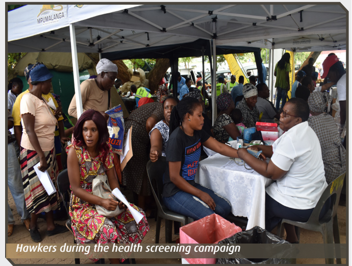
Hawkers during the health screening campaign