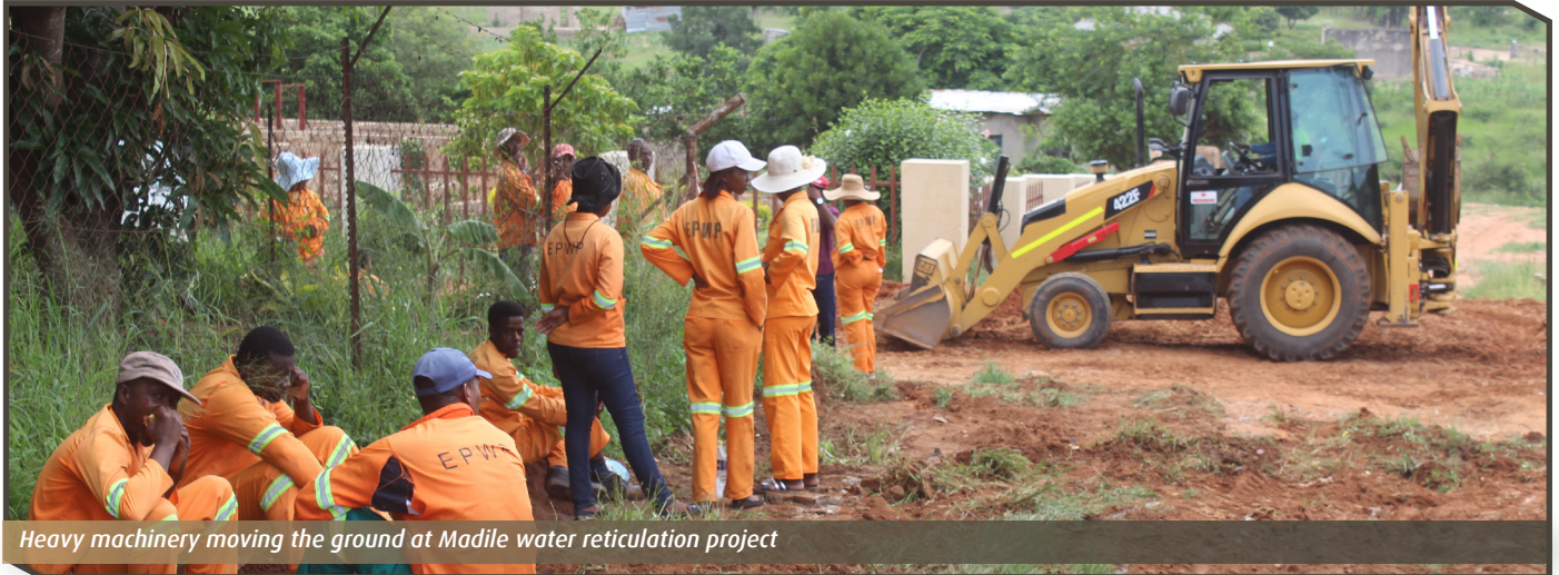
Heavy machinery moving the ground at Madile water reticulation project

The municipality has embarked on a more than R21 Million phase one and two, water reticulation and yard meter connection that comes as a relief to the communities of Tsakani, Madile and Khalanyoni.