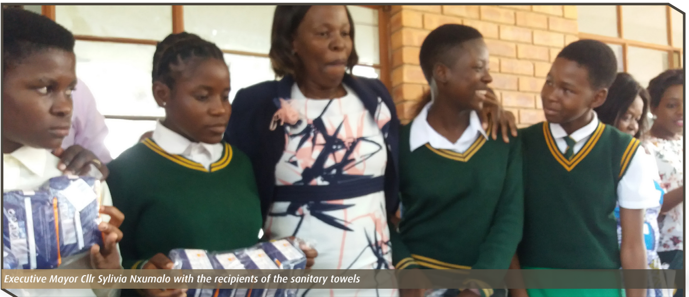
Executive Mayor Cllr Sylvia Nxumalo with the recipients of the sanitary towels

In an effort to restore the dignity of a girl child, the Bushbuckridge Local Municipality (BLM) handed over 5500 sanitary towels to girls from three high schools: Ben W Mashego, Eric Nxumalo and Madlala as well as three community based centres: