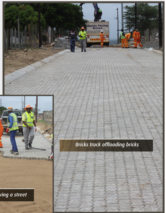
Bricks truck offloading bricks

The formalisation of Hluvukani Internal Streets will not only mean the betterment of the living standard for the people of Hluvukani but, will go a long way in ensuring that the community reaps the benefits of the hard-earned democracy.