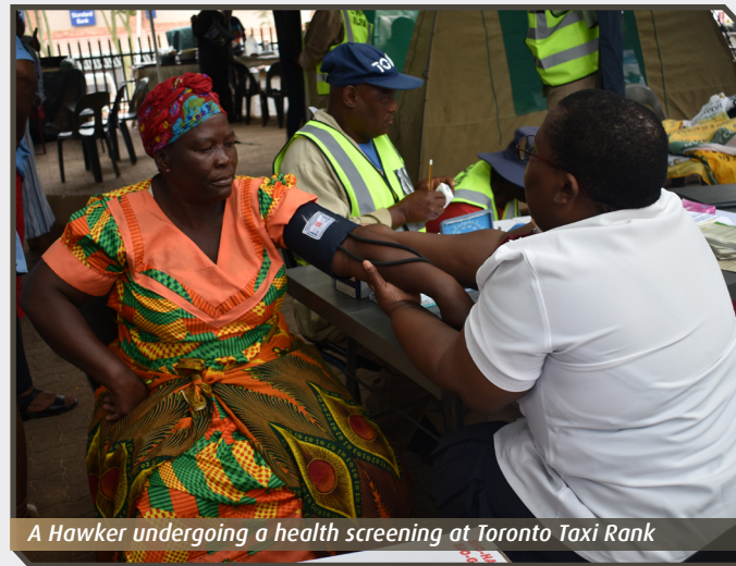
A Hawker undergoing a health screening at Toronto Taxi Rank