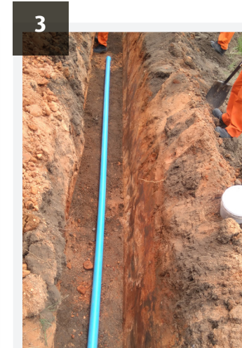
Laying of pipes at Ga-Burney (Bafaladi)