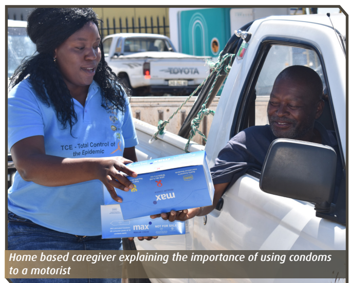
Home based caregiver explaining the importance of using condoms to a motorist

signs and symptoms of STI's to seek medical treatment. During the campaign, 10 000 males and females condoms were distributed and health screenings were rendered for TB, Diabetes, Blood Pressure, Malaria testing and HIV testing.