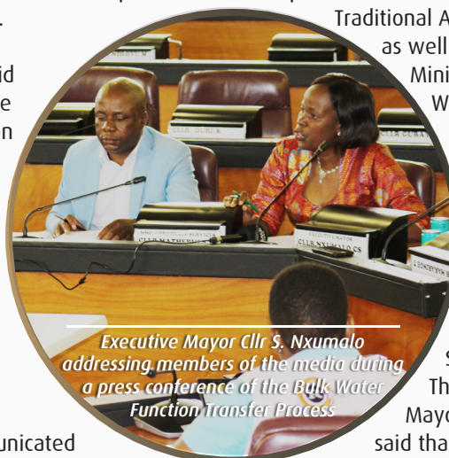
Executive Mayor Cllr S. Nxumalo addressing members of the media during a press conference of the Bulk Water Function Transfer Process

Cooperative Governance and Traditional Affairs as well as the Ministry of Water