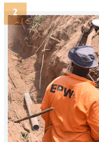
Laying of pipes at Soweto in progress