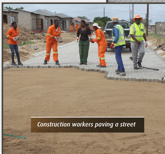
Construction workers paving a street