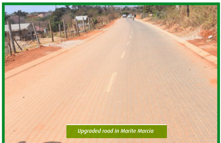
Upgraded road in Marite Marcia

It was a project that created 22 temporary jobs for the local community members.