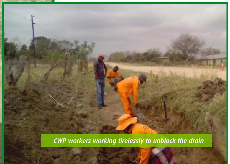
CWP workers working tirelessly to unblock the drain