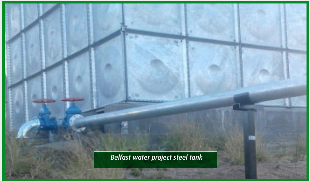
Belfast water project steel tank

About 363 households will benefit from yard connections and the project created 17 job opportunities for the local people.