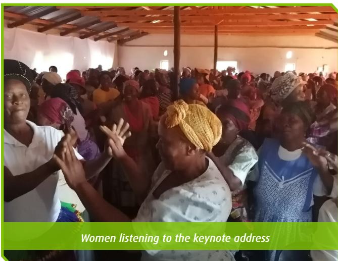
Women listening to the keynote address

She also emphasized that this year's commemoration coincides with the 65th anniversary of the women's charter. All women in attendance were showered with gifts and blankets.