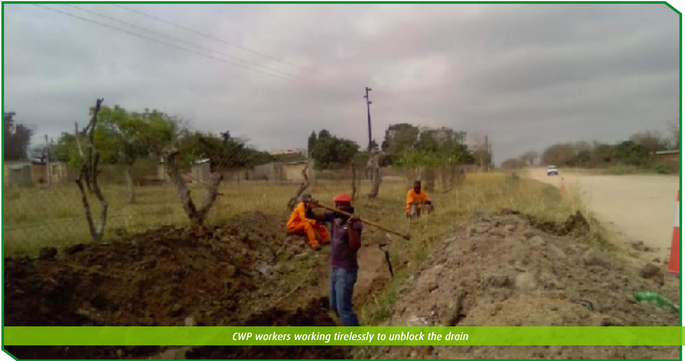
CWP workers working tirelessly to unblock the drain

C ommunity Work Programme (CWP) workers helped in unblocking a drainage system located on the main road in Edinburg, ward 36 under the Bushbuckridge Local Municipality (BLM). The blocked drainage system was causing excessive flooding on the