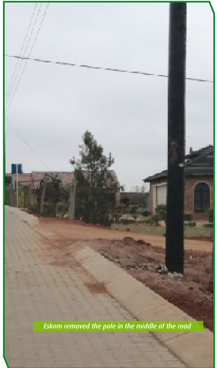
Eskom removed the pole in the middle of the road

The municipality has over the years advocated and pleaded with our Traditional Councils and in particular our Indunas to follow correct procedures and town planning regulations when establishing new settlements within the municipality.