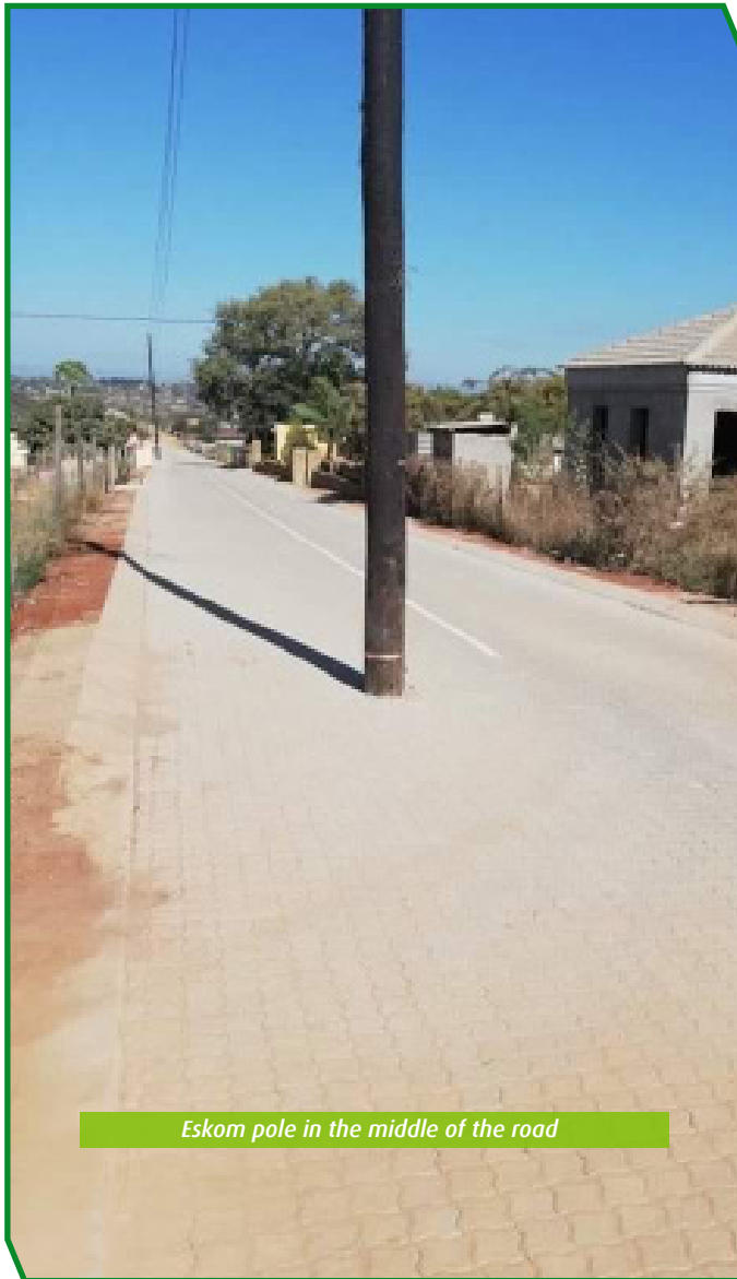
Eskom pole in the middle of the road