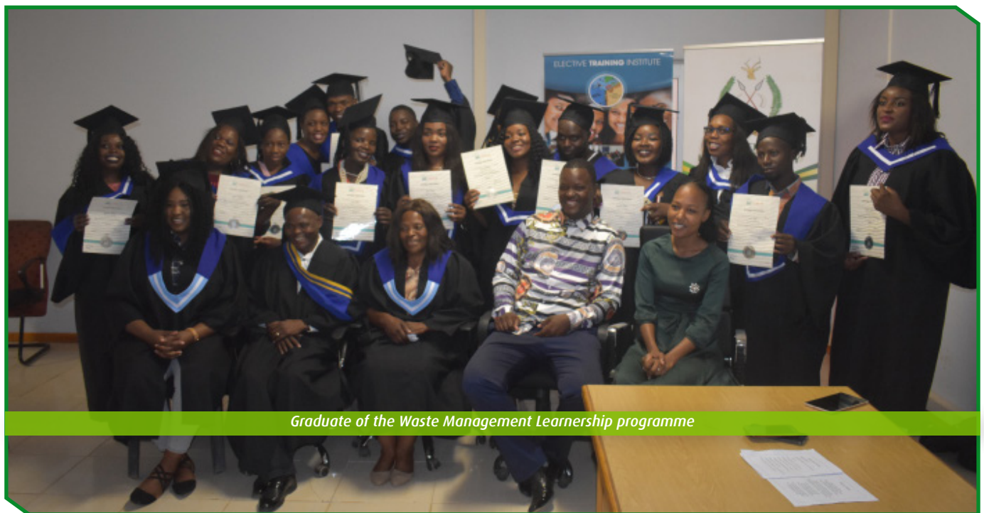
Graduate of the Waste Management Learnership programme

The participants of the Environmental Management Learnership programme have graduated with a National Certificate in Environmental Management NQF Level 5. The graduation ceremony was held at the municipal PMU Boardroom on 13 September 2019.