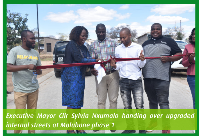
Executive Mayor Cllr Sylvia Nxumalo handing over upgraded internal streets at Malubane phase 1

The project scope included 90mm paving blocks, construction for erosion protection, Concrete V drains, Kerbs and culverts precast units.