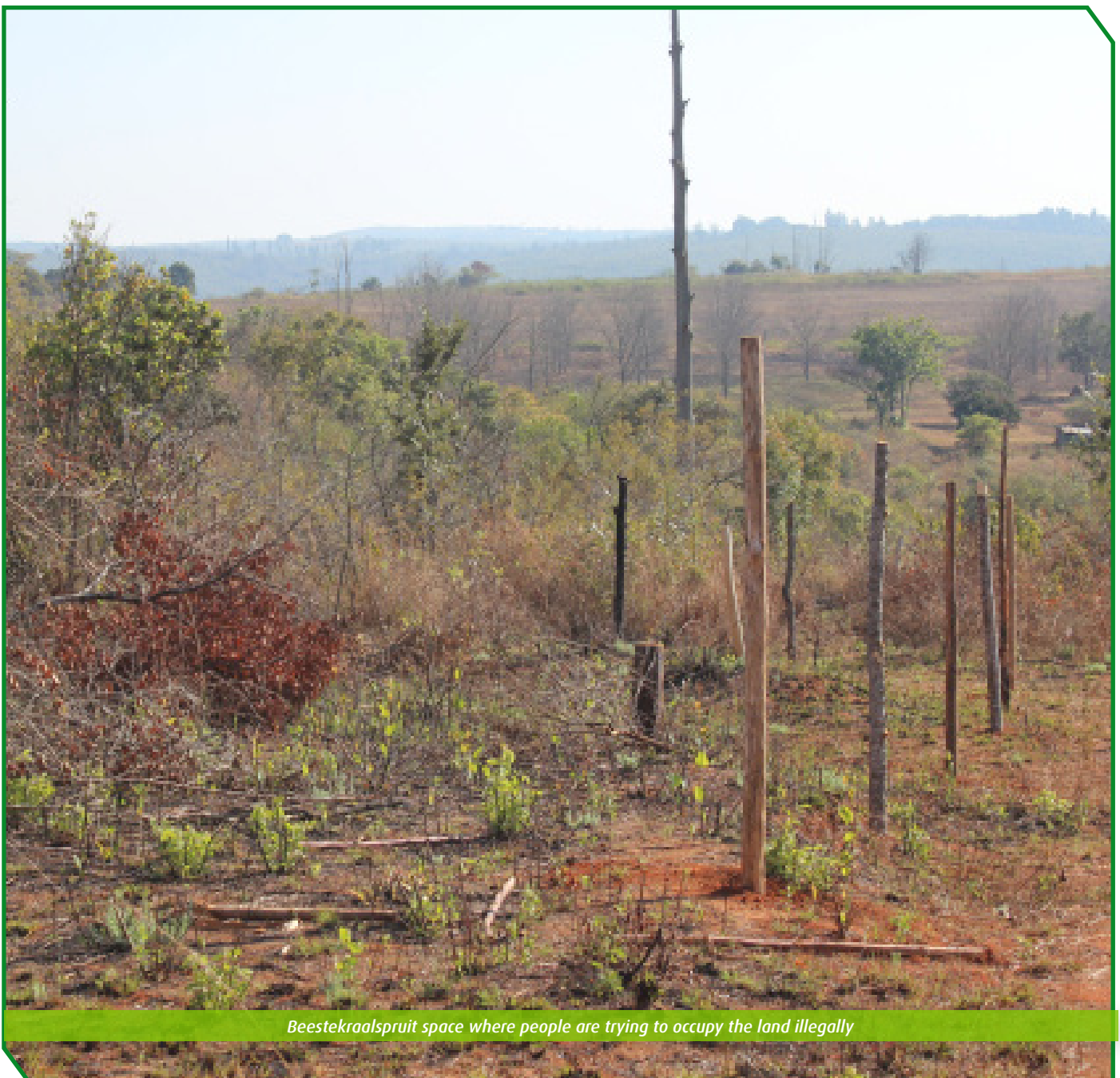
Beestekraalspruit space where people are trying to occupy the land illegally

advised to check with the municipal town planning unit before buying stands or site to ascertain if the land has been approved for development and settlement.