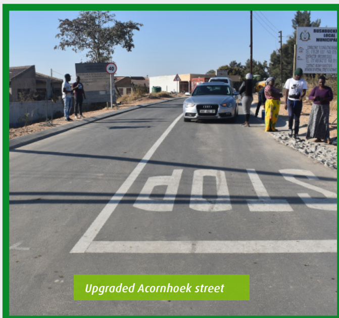
Upgraded Acornhoek street

The upgraded Plaza view internal street phase in Acornhoek was officially opened by the Executive Mayor on 18 July 2019. The construction of the internal street started on 12 December 2018 and was completed on 24 June 2019 at the tune of R 9.5 million.