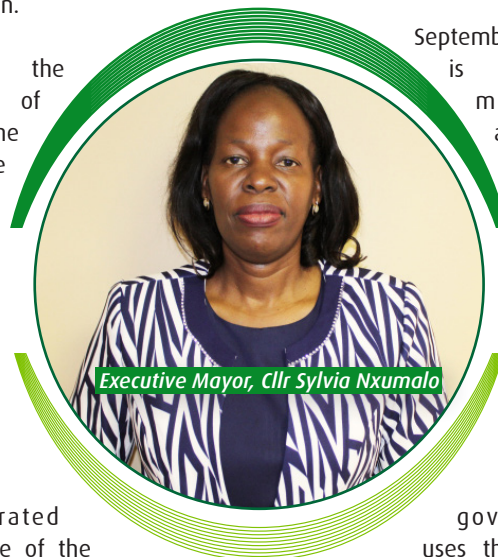
Executive Mayor, Cllr Sylvia Nxumalo

September month is Heritage month and the