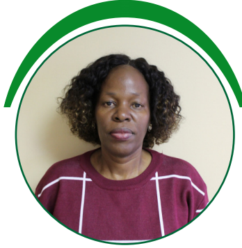
Executive Mayor Cllr Sylvia Nxumalo