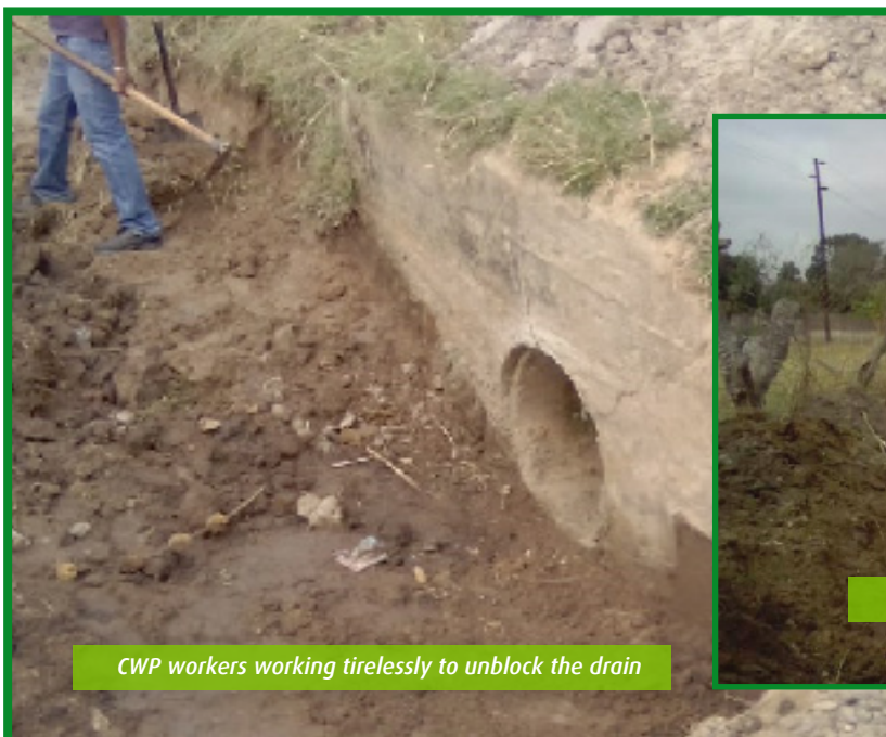
CWP workers working tirelessly to unblock the drain

assets and services in poor communities. CWP is a means to alleviate poverty by getting the unemployed to do something for their community in an exchange for a stipend.