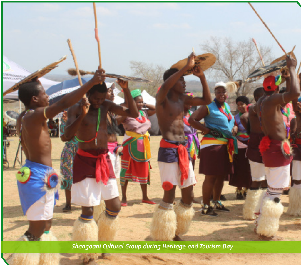
Shangaani Cultural Group during Heritage and Tourism Day

Traditional and cultural practices play a pivotal role in the upbringing of a child and the building of society at large.