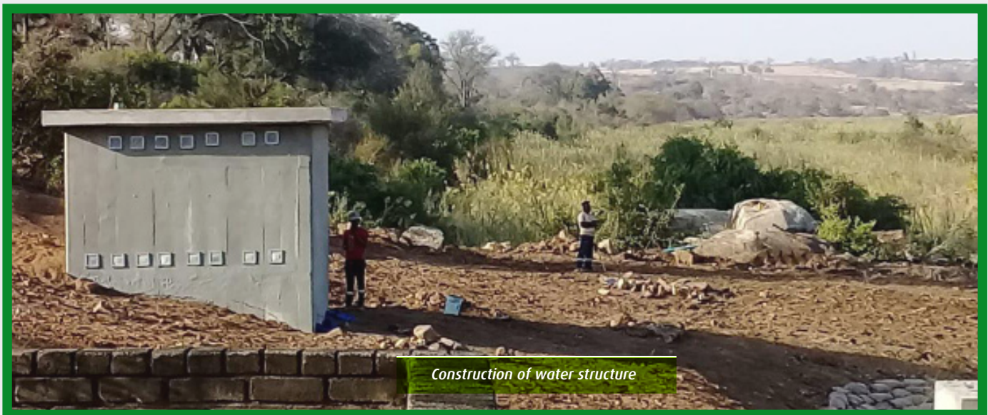
Construction of water structure