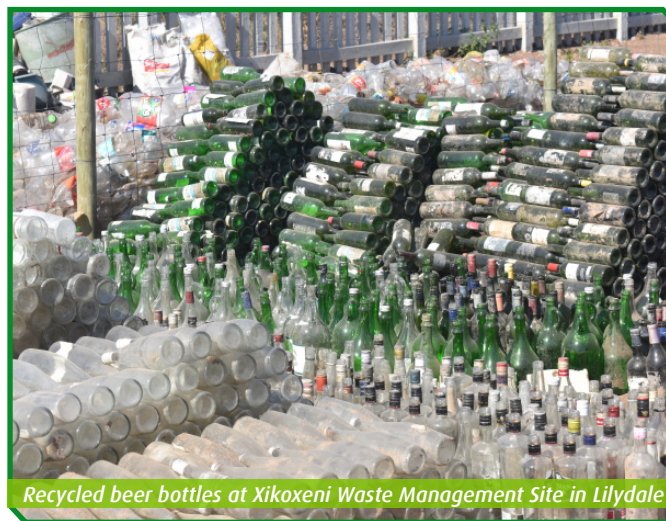
Recycled beer bottles at Xikoxeni Waste Management Site in Lilydale

for South Africa and Africa to develop service delivery systems that are native to its communities.