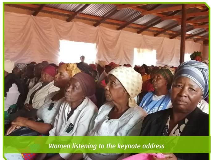
Women listening to the keynote address