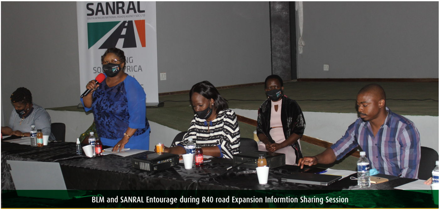
BLM and SANRAL Entourage during R40 road Expansion Information Sharing Session

The Bushbuckridge Local Municipality (BLM) Executive Mayor, Speaker of Council and entourage played host to the South African National Road Agency Limited Team (SANRAL) for an information-sharing session on the expansion of the R40 Road Project.