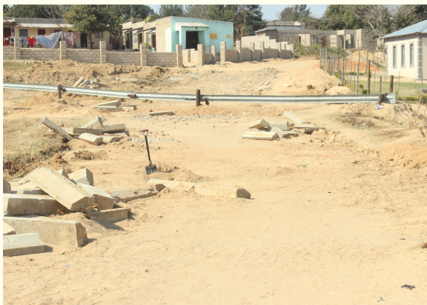
Acornhoek-Plaza By-Pass Road under construction

BLM is urging members of the community not to embark on violent service protests when asking/ demanding something from the government. The government and the municipality are in the process of ensuring that the needs of the community are met and that members of the community must familiarise themselves with government processes and not allow hooligans to mislead them into destroying government and private property when venting out their frustrations.