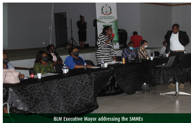
BLM Executive Mayor addressing the SMMEs

In conclusion, the Mayor urged our community members to practice patience and avoid unnecessary arguments like what we saw at Acornhoek Merriam Mokgakane Community Hall with people aiming to force themselves in. SANRAL has given every SMME an opportunity to be part of the proceedings from outside the hall by connecting to the link provided and also had a live stream thus adhering to the National Lockdown of Coronavirus regulations.