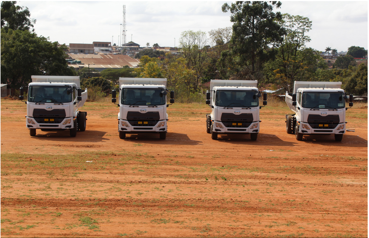
Brand new fleet

The municipality has added four (04) new UD Tipper Trucks to its service delivery fleet system. These trucks come as demand for the ever-growing waste and environment pollution continues to show its ugly head in the Bushbuckridge municipal area of jurisdiction. The municipality hopes that the fleet comes in handy as it continues the fight against environmental pollution as it is a health hazard in the municipal vicinity.