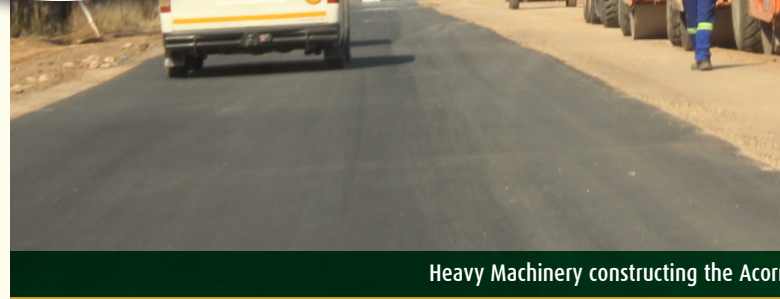
Heavy Machinery constructing the Acor

reach to other intended destinations resulting in unprecedented violent service delivery protests.