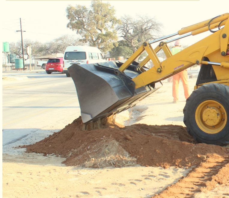
Heavy machinery on Saselani

investment will now be easily directed to the area due to its road standard. It means that the government has created a conducive environment for the private sector to operate on and create job opportunities for the people.