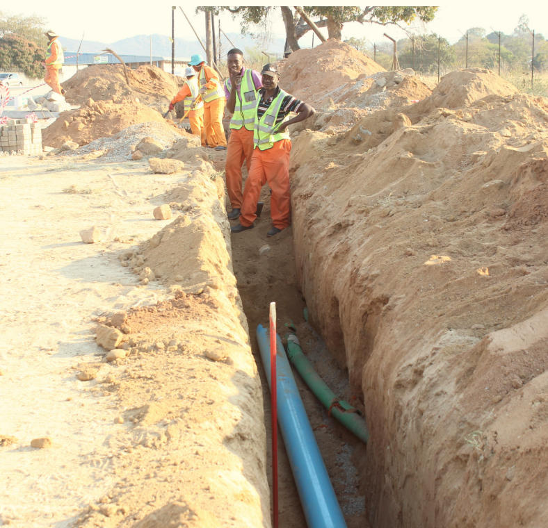
Saselani-Buyisonto water reticulation underway

Community members are urged to safeguard any asset built within their communities and in this regard roads, upgraded streets, clinics, schools to mention just a few. The construction of Agincourt tar road has come at a high cost and the municipality is pleased to announce that the project is proceeding well. The tar road will improve people's lives in the biggest possible way one can ever imagine. Political criminal encouraging members of the community to fill the streets and tarred roads in violently and illegally under the pretext of protesting against poor service delivery by burning roads, schools and clinics.