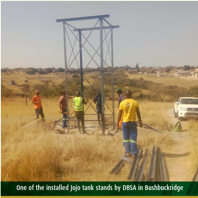
One of the installed Jojo tank stands by DBSA in Bushbuckridge

As part of Covid-19 relief, Development Bank of Southern Africa (DBSA) has partnered with Bushbuckridge Local Municipality (BLM) to help provide communities with clean portable water.