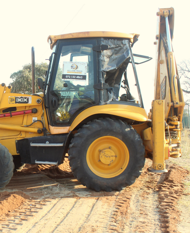
ni-Buyisonto water reticulation project