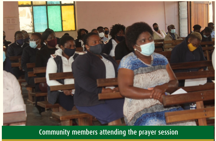
Community members attending the prayer session

In conclusion, the Executive Mayor encouraged the Matikwane hospital staff to ensure that they take the precaution of every move they make when attending patients as by doing so, they are protecting themselves, families and everyone around them. She further advised everyone to ensure that they lead by example at the workplace, their homes, shopping complexes and wherever they may be.