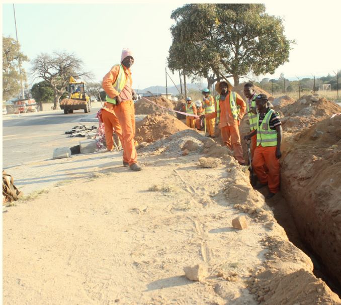
Saselani-Buyisonto water reticulation underway