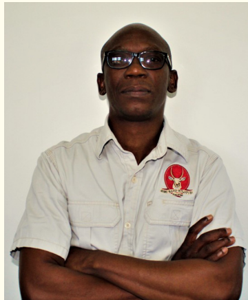
Newly appointed Sabie Sand Wildtuin CEO

Park, Sabie Sand Wildtuin, Manyeleti, Andover and other