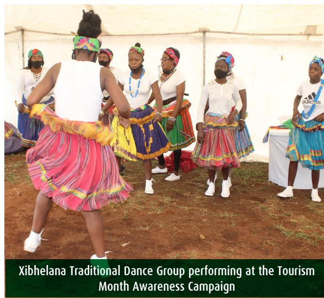
Xibhelana Traditional Dance Group performing at the Tourism Month Awareness Campaign

destruction of the fence on the reserve. She pleaded with stakeholders, in particular, Traditional Leaders and the South African Police Service (SAPS) to urge members of the community to refrain from