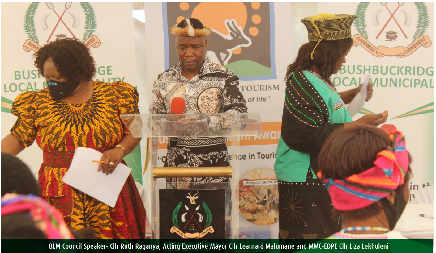
BLM Council Speaker- Cllr Ruth Raganya, Acting Executive Mayor Cllr Learnard Malumane and MMC-EDPE Cllr Liza Lekhuleni

The Bushbuckridge Local Municipality (BLM) and Bushbuckridge Local Tourism Organization (BLTO) in partnership with the Mpumalanga Tourism and Parks Agency (MTPA) celebrated Tourism month in style.