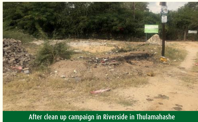
After clean up campaign in Riverside in Thulamahashe

dumping waste on areas that are not designated as dumping sites. She is pleading with residents of Bushbuckridge to recycle waste and become more environmentally conscious. The Mayor alluded that illegal