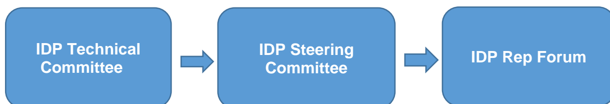
Figure 01: Organisational Arrangement

N.B: The roles and responsibilities of the above structures are defined in the following chapter programme/plan of this document.