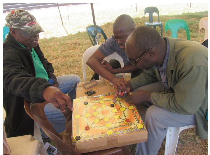
People with Disability busy playing Morabaraba