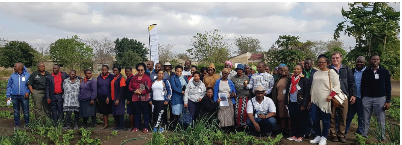
BRICS Summit delegates outside the Home Based Care in Lillydale