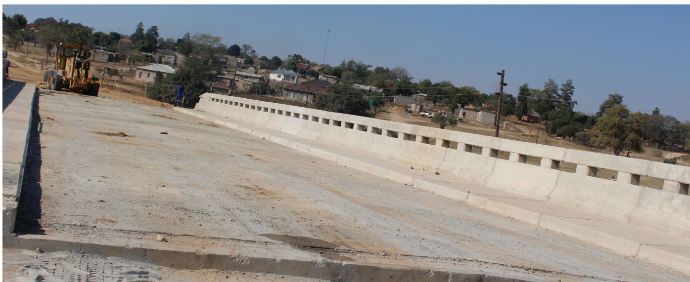
Bridge under construction at Kildare about to be completed