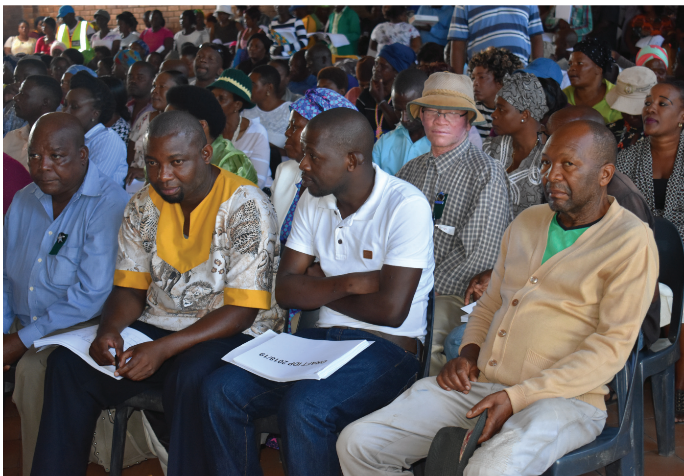
Members of the public who attended the IDP, Budget and Tarrifs public participation meetings

The BLM Executive Mayor, Members of the Mayoral Committee, Councillors, Acting Municipal Manager, Directors and Managers were part of the public consultation roadshows.