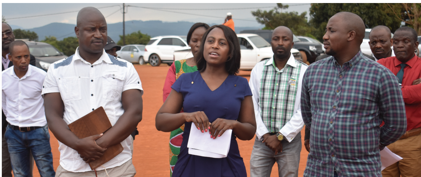
Public Works MEC officially unveiling the contractor for the construction of marite via Goromane to Hoxane tar road

The Mayor also made a clarification call for drivers to slow down and take precautionary measures during the construction period.