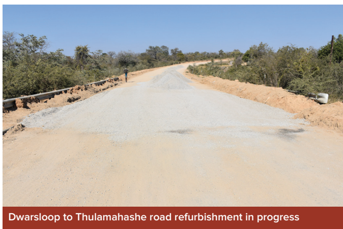
Dwarsloop to Thulamahashe road refurbishment in progress

The rehabilitation and refurbishment of this road will ensure that motorists drive in a smooth and safe environment.