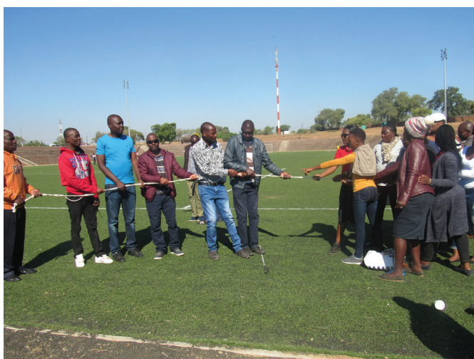
People with Disability on a Tug-of- War during the Disability Sports Day Celebration