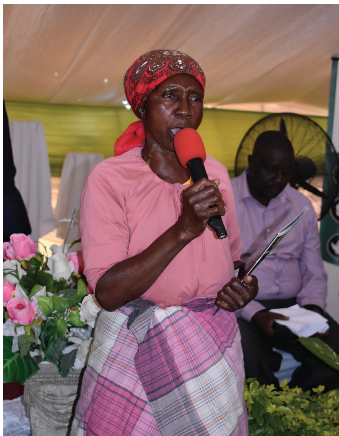
A senior citizen asking a question during the joint-service delivery imbizo on 08 June 2018