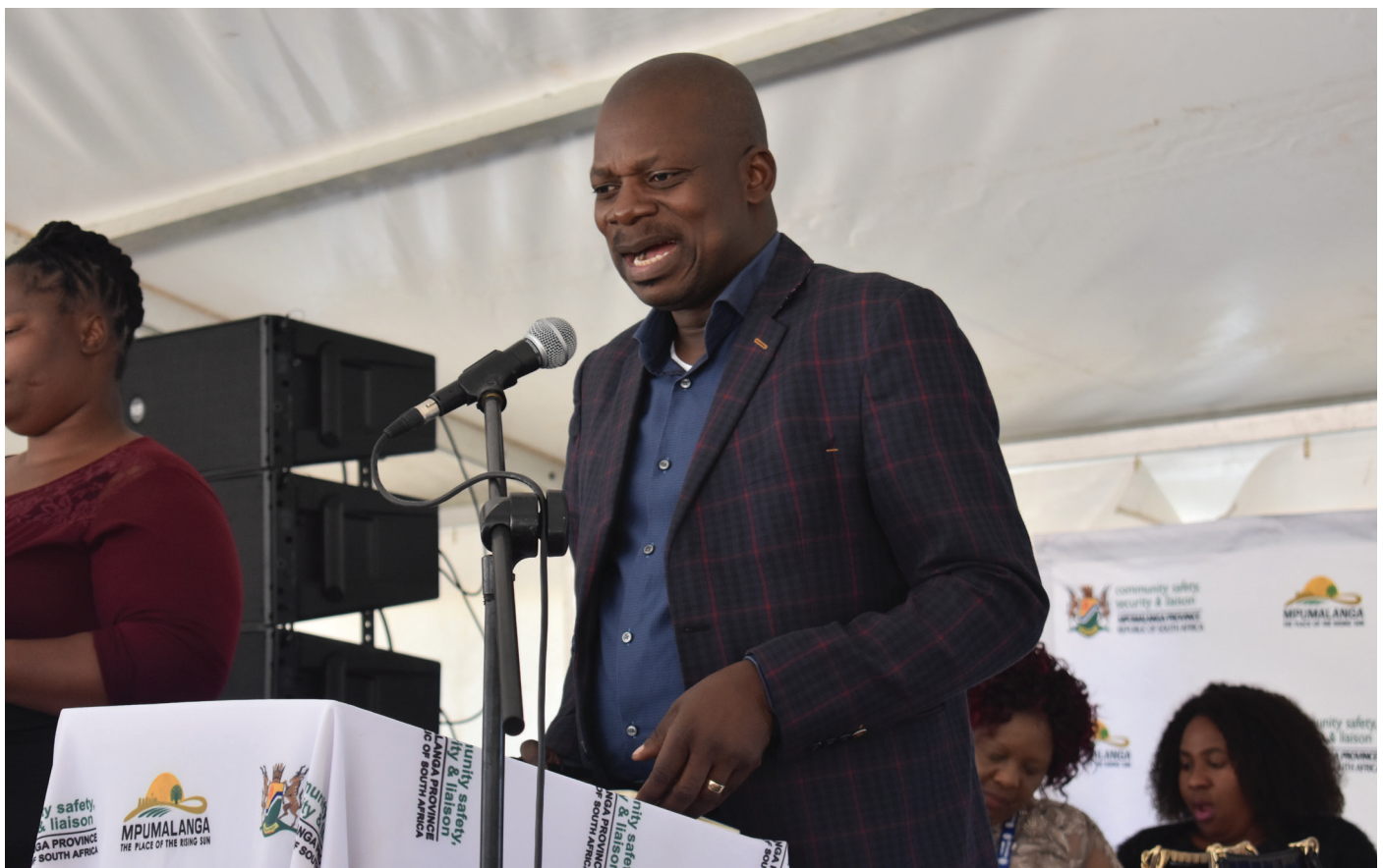
MEC of Community Liaison , Safety and Security delivering a keynote address during Security Imbizo held at Arconhoek Sports Field on the 24 June 2018