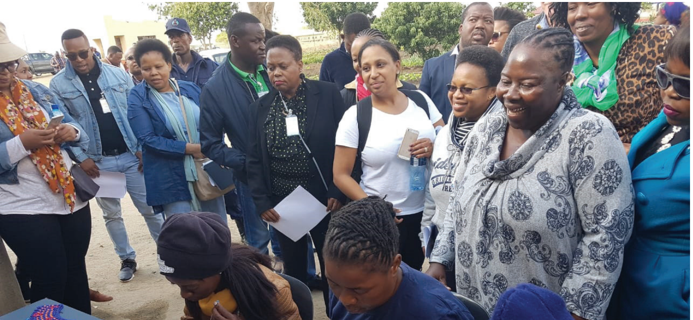
BRICS Summit delegates inspecting the Lillydale Home Based Care

Climate change refers to switch in the statistical distribution of weather patterns and that change lasts for an extended period of time.