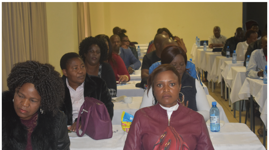
Community development Workers who attended the Local Geographical Name Change Summit held at Gannet place from the 22-23rd of May 2018