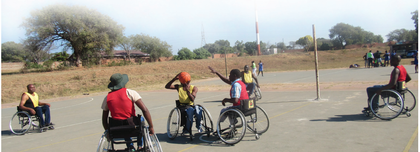
People with Disability on wheel chairs during sports day celebrations

Wrapping up the day before sporting activities resumed, the Acting Executive Mayor urged people with disability to unleash all their strengths on what benefits them, health-wise and to gain skills which help them secure decent jobs and other endeavours, Acting Executive Mayor concluded.