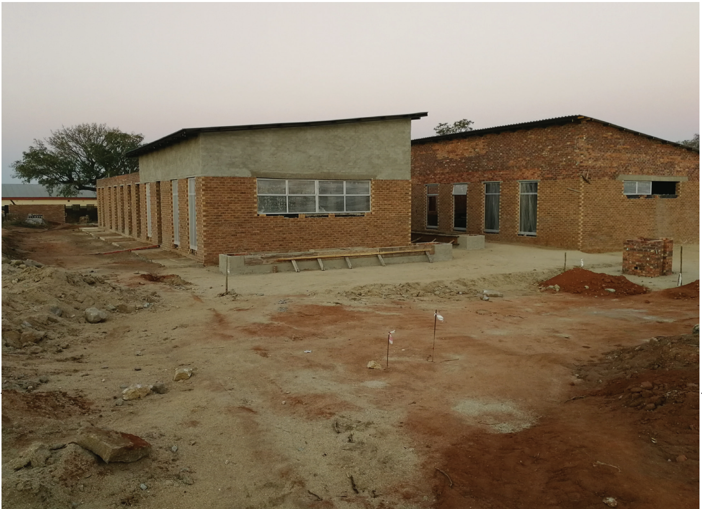
Construction of MP stream Public Library in session

The Department of Culture, Sport and Recreation is working together with the municipality in constructing the sixth public library in the MP Stream, which is situated near Thulamahashe at a tune of 14 million rands. The proj-